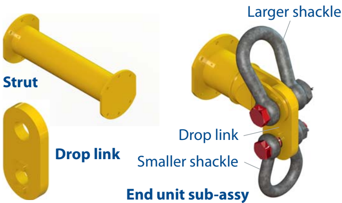
Table 1 – Component List